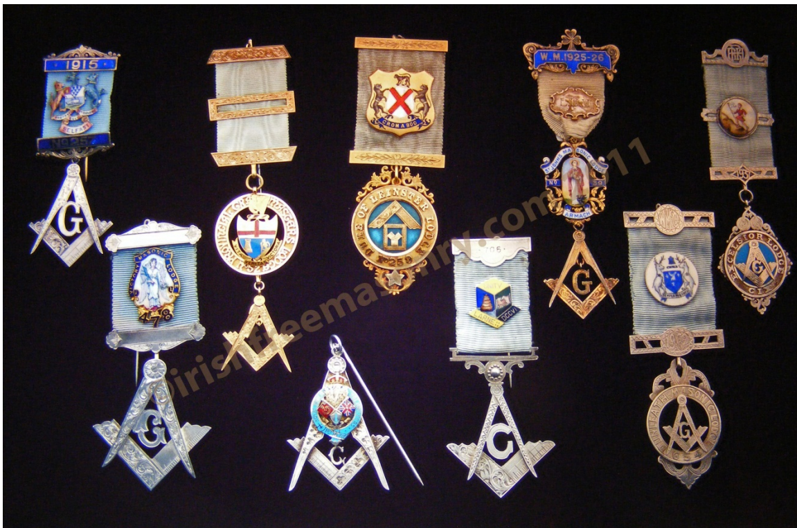
Plate 6 illustrates a number of pinback PM jewels and these use a variety of colourful mottos and devices to illustrate the Lodge crests. I enclose a representative sample of nine jewels, to give some idea of the breadth and

scope of jewels which may be seen in our Masonic museums or indeed worn at our meeting