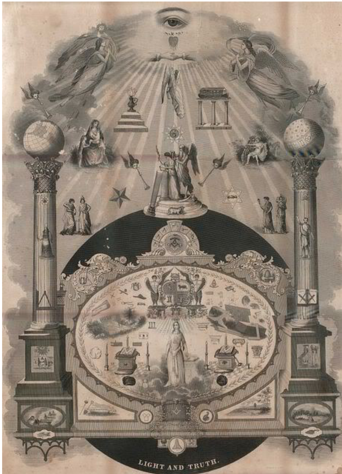
KEY TO MASONIC CHART OF "LIGHT AND TRUTH"

This engraving takes from the Hebrew, Yer he eour, "Let there be Light," and Ho-a-mess, "The Truth".