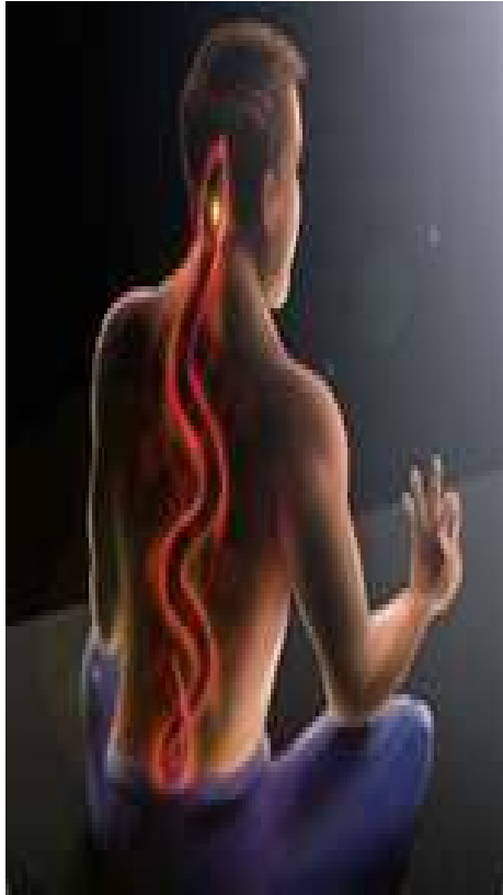
KUNDALINI SNAKE DEMON