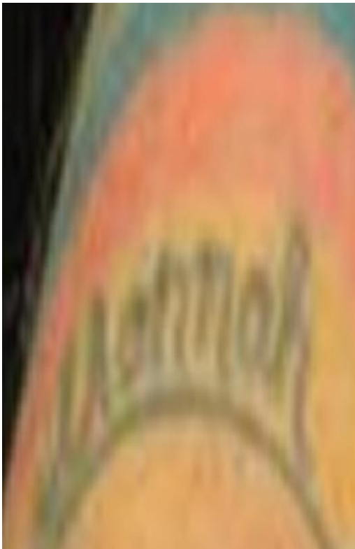
SHONNAH TATTOO ON BENTLEY'S ARM OF FORSAKEN WIFE

http://www.youtube.com/watch?v=MMD7HWapwPs