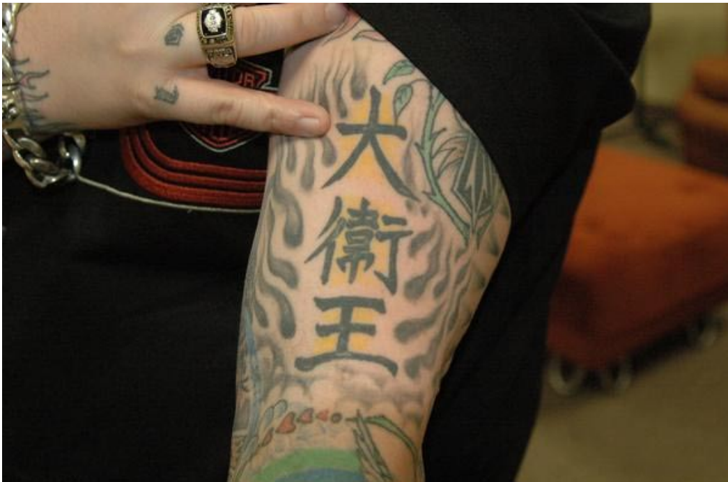
EMMA-0 LAKELAND REVIVAL ANGEL THAT WALKS THE AISLES