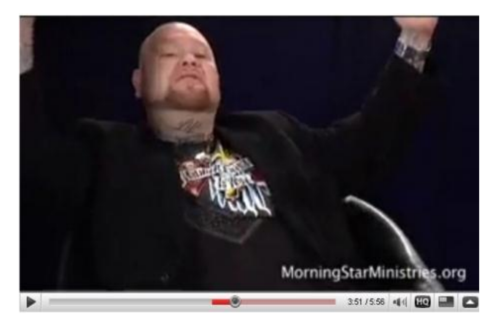
Why can't I be the greatest advocate of marriage?

[Here he makes an over the top huge sweeping gesture - see still shot below from when he says this at 3.51 minutes - this body language underlines the bragging, the lying and also the delusional sense of grandeur]