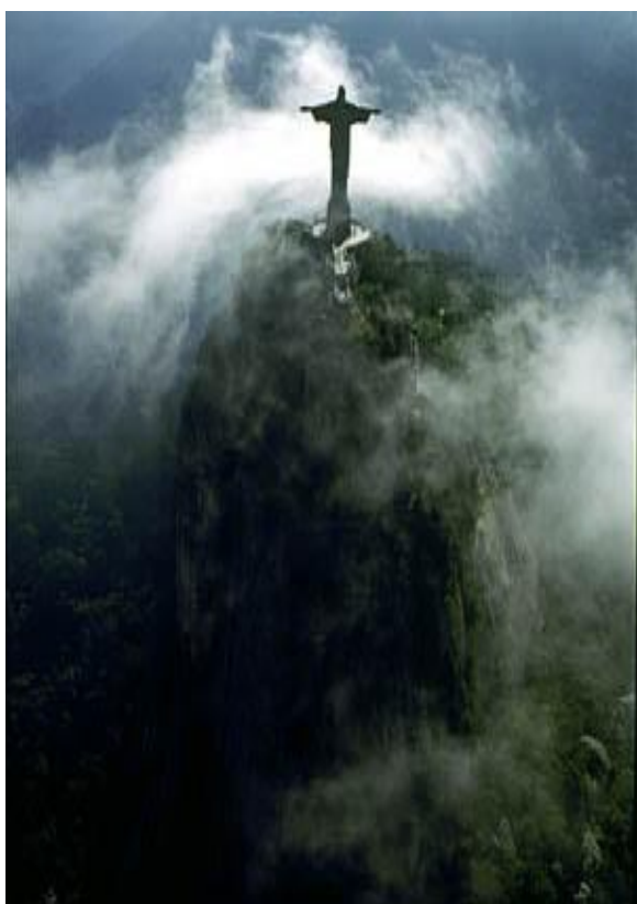
OF CREATION: COSMIC CHRIST ...

They want you to be converted into become a new style Cosmic Christian but you must interchange your biblical Jesus Christ and His Deity with a NEW AGE CHRIST; but you learn to open your own personal Star Gate. The apostle John was given in phenomenal vision a glimpse of the end of the age. (Rev. 1:10), called the "Day of the Lord" During this "day of the Lord's wrath" (Zep. 1:18), God will punish humanity for their proud, sinful ways and their refusal to acknowledge Him as the true God. In Revelation 9:11, an intriguing character is introduced: "And they had a king over them, which is the angel of the bottomless pit, whose name in the Hebrew tongue is Abaddon, but in the Greek tongue hath his name Apollyon," (Rev. 9:1-11).